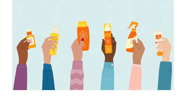
Our dermatology experts warn <u>against spread of sunscreen</u> misinformation on social media