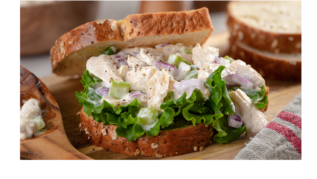
salad, bursting with zesty lemon and fresh herbs, is perfect for <u>summer</u>