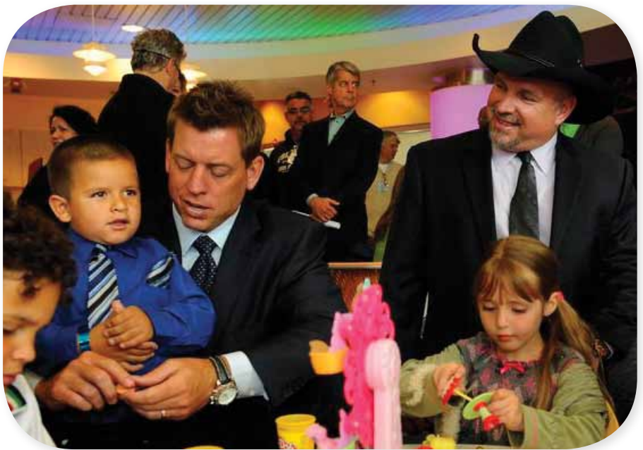
Troy Aikman and Garth Brooks visit Denver Health.